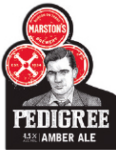
PEDIGREE ABV 4.5% Marston's, Burton-on-Trent