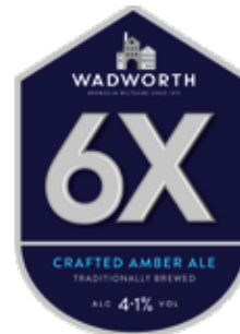
6X* ABV 4.1% Wadworth, Wiltshire