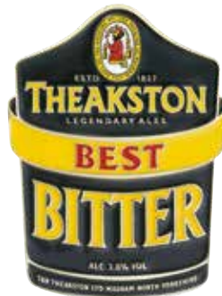
BEST BITTER ABV 3.8% Theakston, Masham