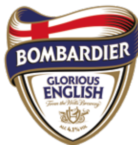
BOMBARDIER ABV 4.1% Charles Wells, Bedford