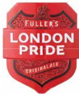
LONDON PRIDE ABV 4.1% Fuller's, Chiswick