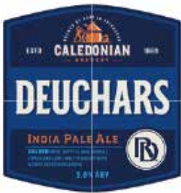
DEUCHARS IPA ABV 3.8% Caledonian, Edinburgh