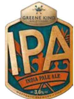
GREENE KING IPA* ABV 3.6% Greene King, Bury St Edmunds