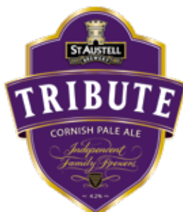
TRIBUTE* ABV 4.2% St Austell, Cornwall