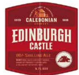
EDINBURGH CASTLE ABV 4.1% Caledonian, Edinburgh