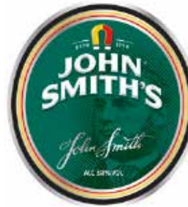
JOHN SMITH'S ABV 3.8% John Smith's, Tadcaster